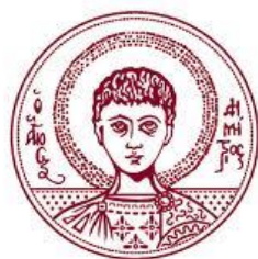
ARISTOTLE UNIVERSITY OF THESSALONIKI