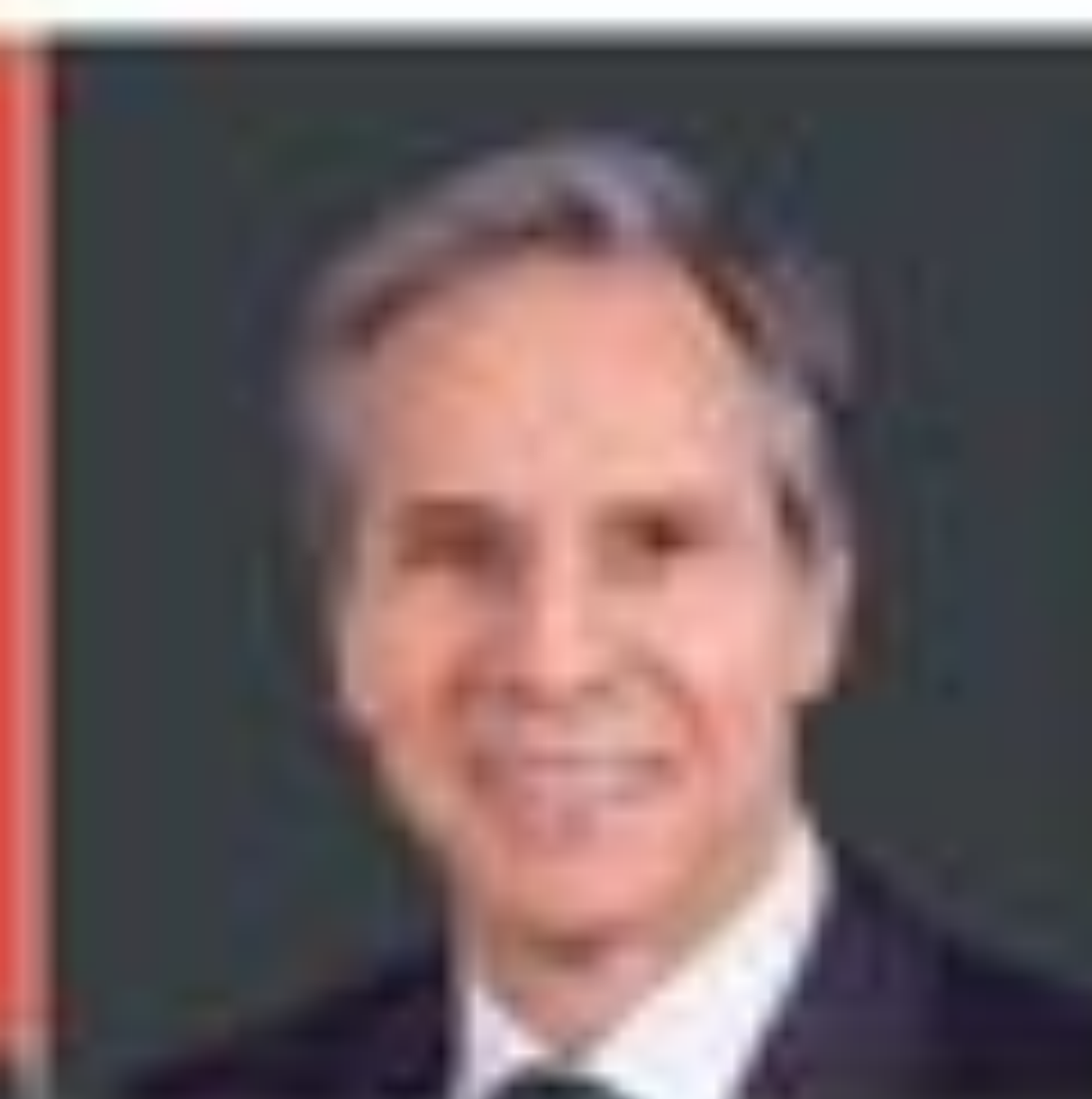
H.E. Antony Blinken Secretary of State of the United States of America