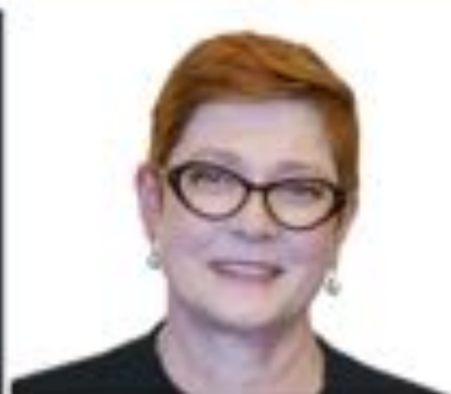
The Hon. Marise Payne Minister for Foreign Affairs of Australia