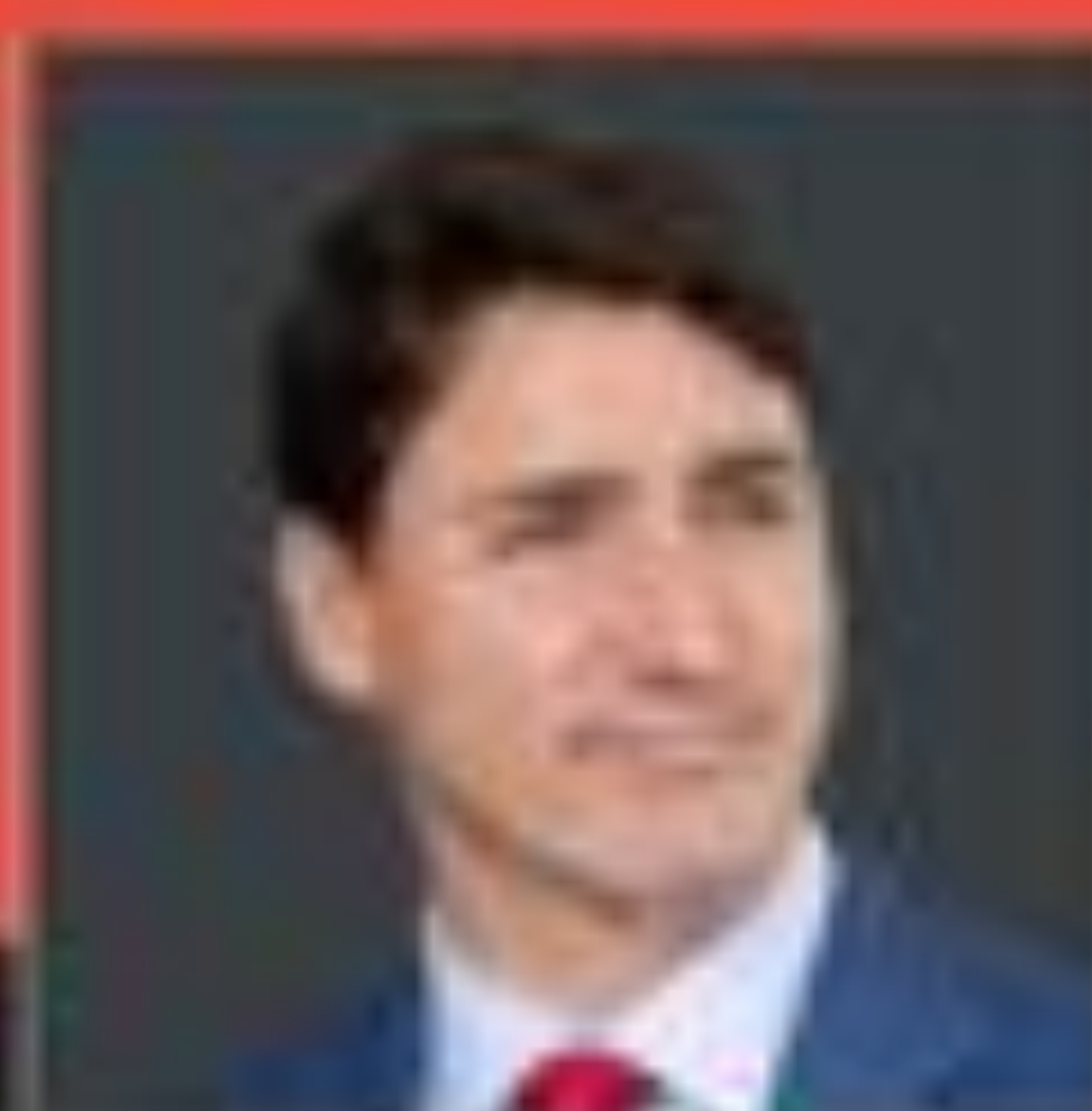
H.E. Justin Trudeau Prime Minister of Canada