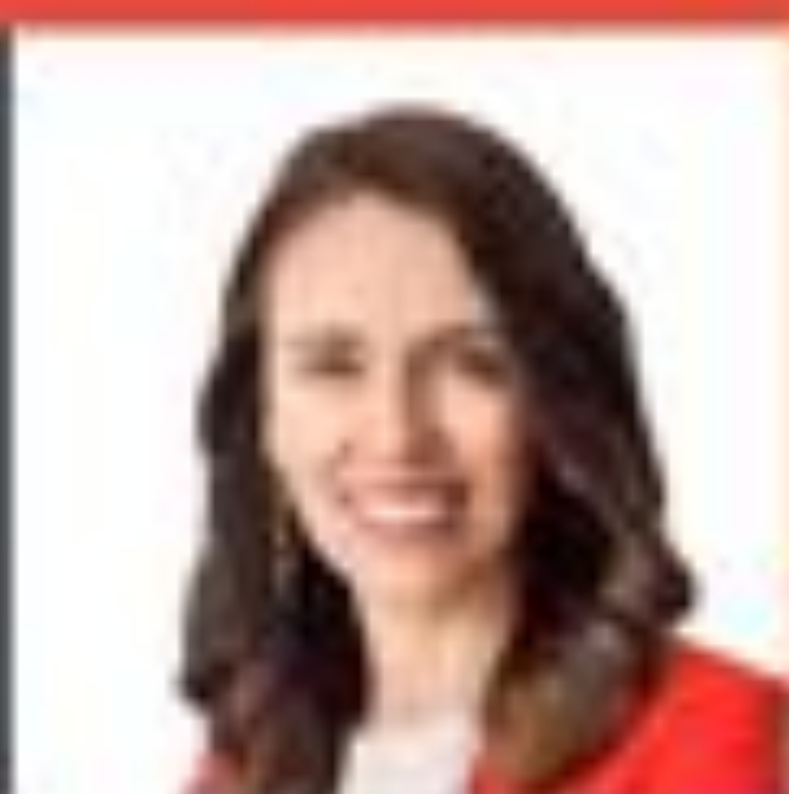
Rt. Hon. Jacinda Ardern Prime Minister of New Zealand