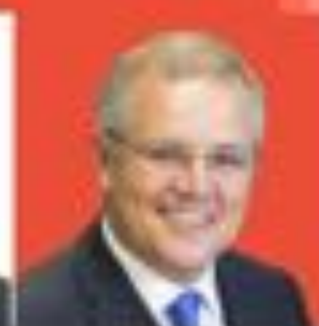
The Hon. Scott John Morrison Prime Minister of Australia