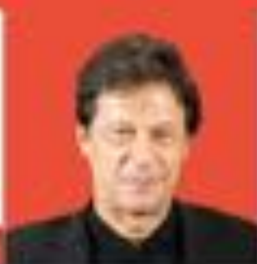
H.E. Imran Khan Prime Minister of Pakistan