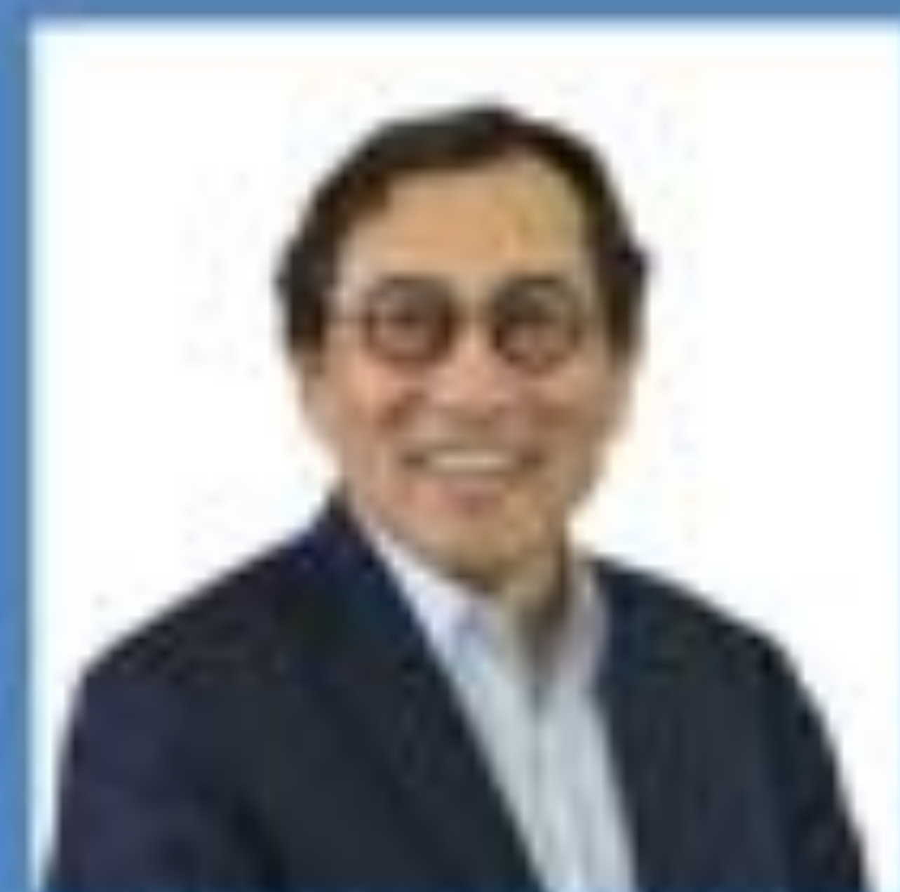
H.E. Bilahari Kausikan Permanent Secretary of Singapore's Foreign Ministry (2008–2020)