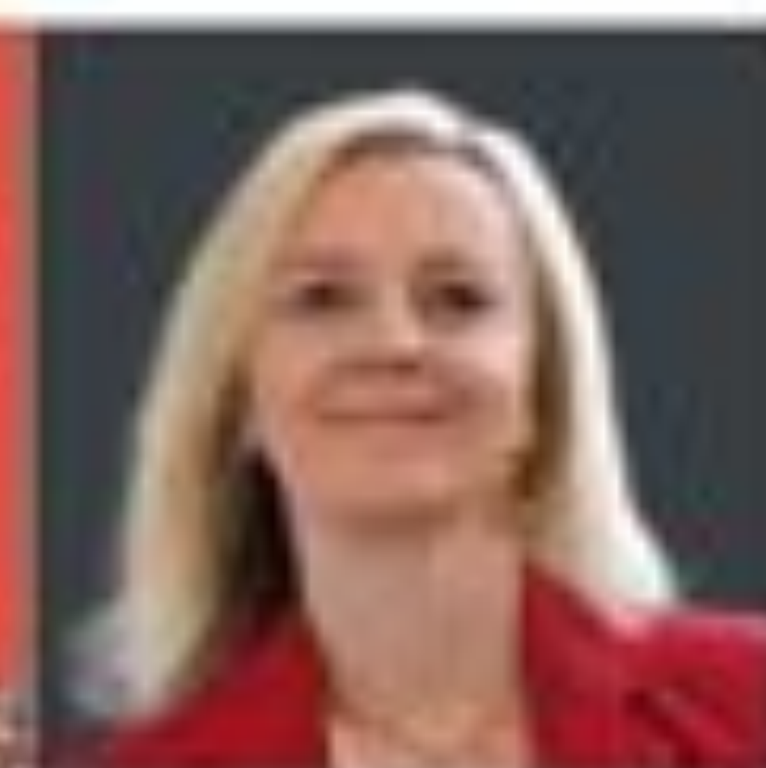
Rt. Hon. Elizabeth Truss Foreign Secretary of the United Kingdom