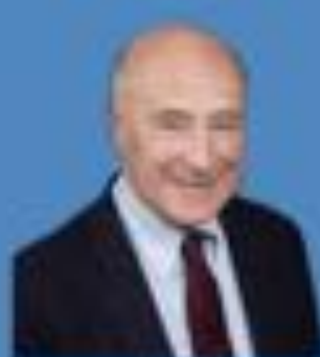
Prof. Joseph S. Nye Jr. University Distinguished Service Professor, Emeryball, and Former Dean of the Harvard Kennedy School of Government