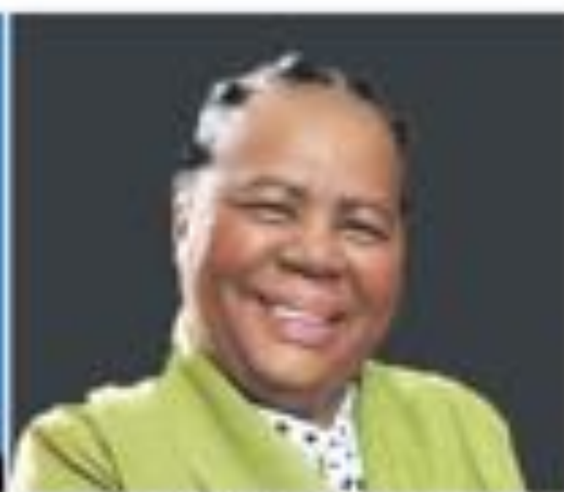
H.E. Naledi Pandor Minister of International Relations and Cooperation of South Africa