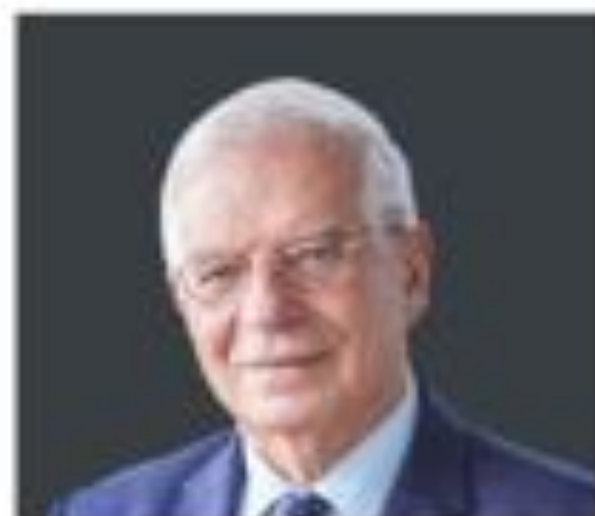
H.E. Josep Borrell Fontelles High Representative of the European Union for Foreign Affairs and Security Policy