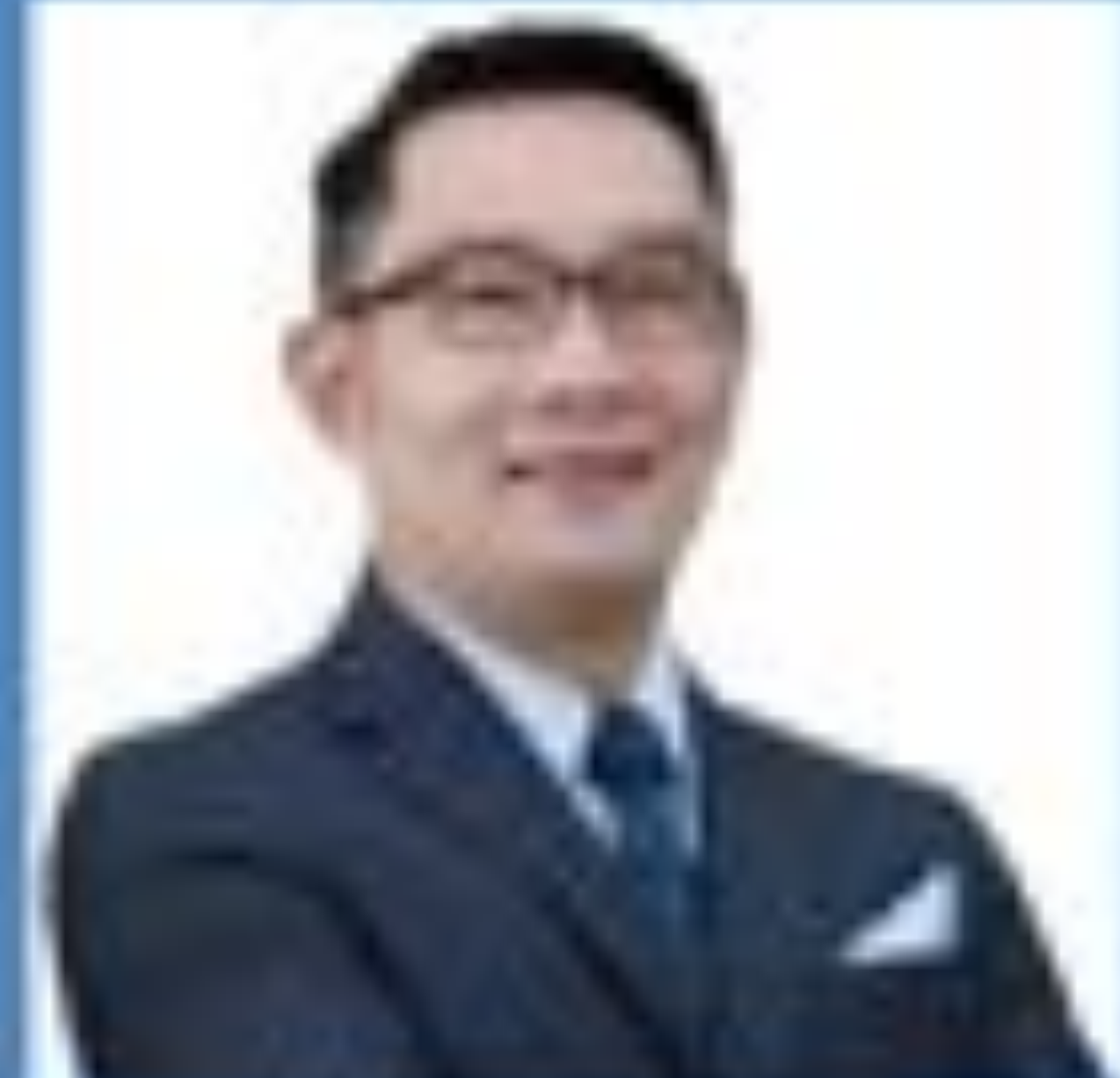
Ridwan Kamil Governor of West Java, Indonesia