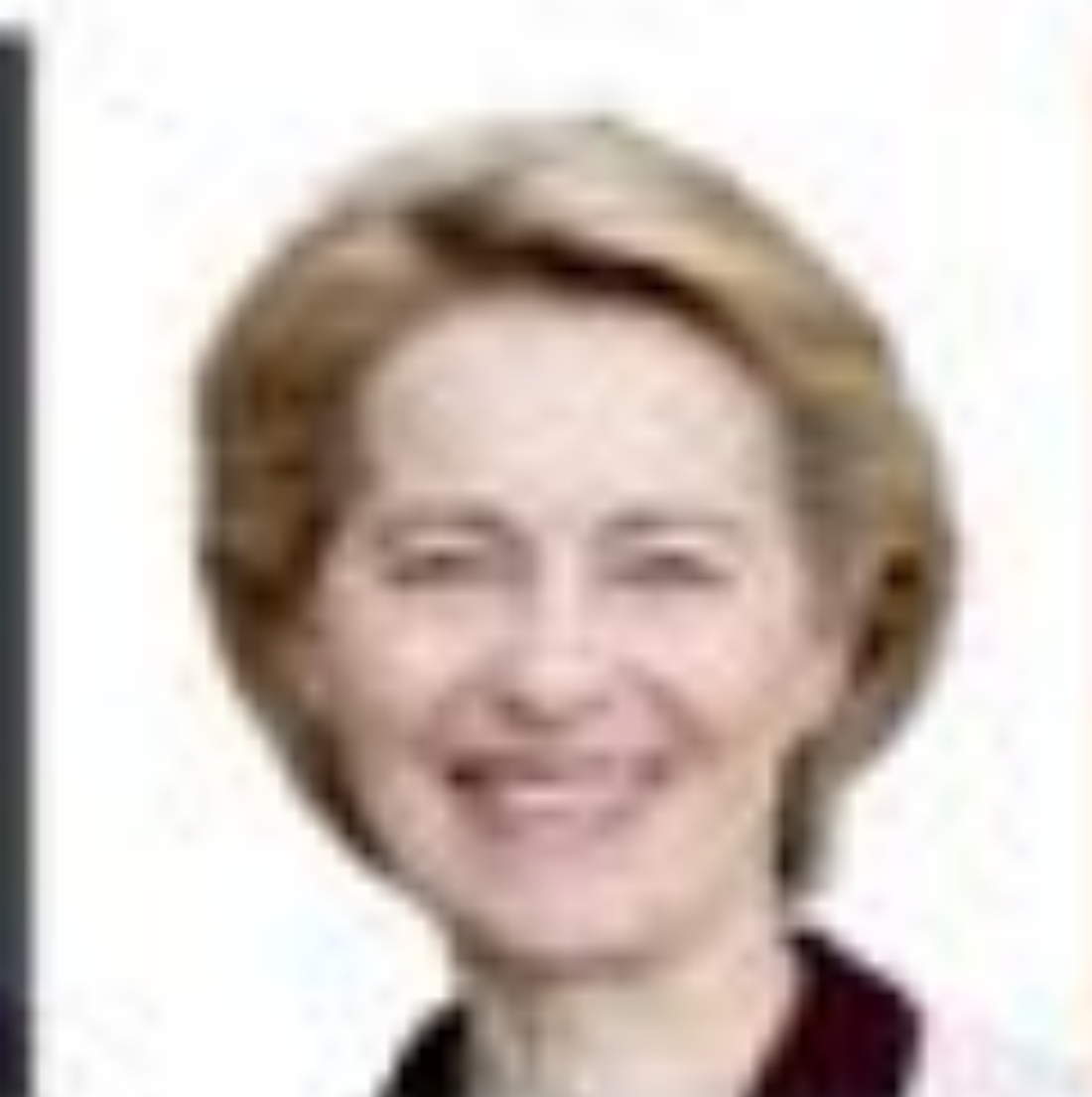
H.E. Ursula von der Leyen President of the European Commission