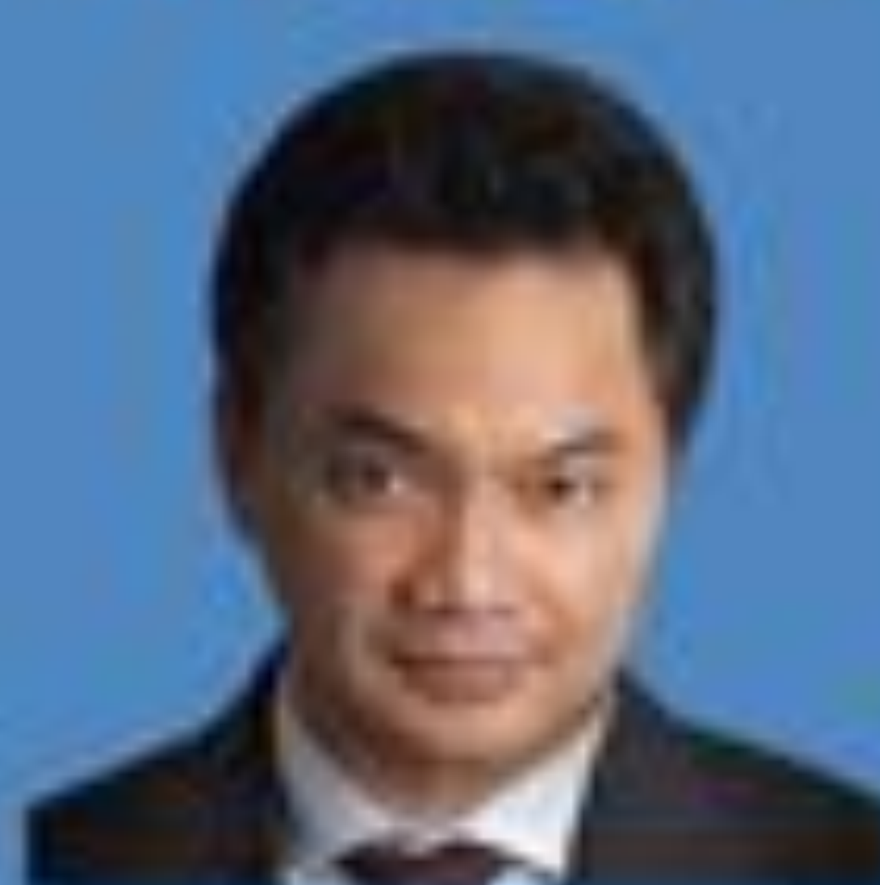
Dr. Dino Patti Djalal Founder and Chairman of Foreign Policy Community of Indonesia (FPCI)