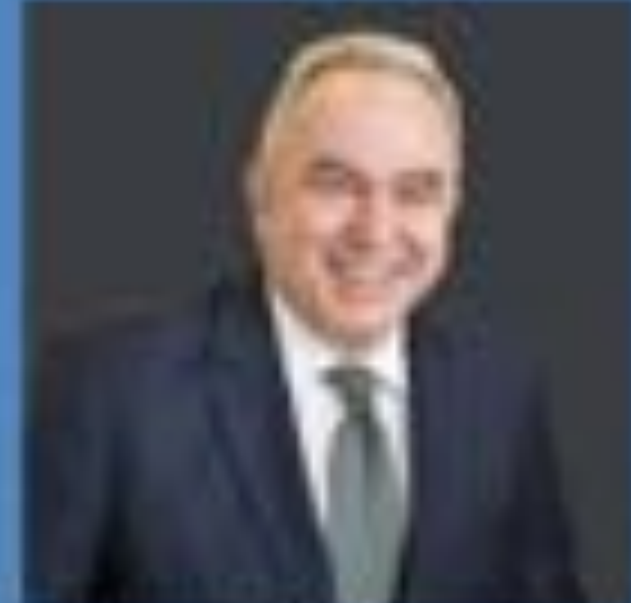
Dr. Kurt M. Campbell Deputy Assistant Secretary for Asia-Pacific Affairs, NSC