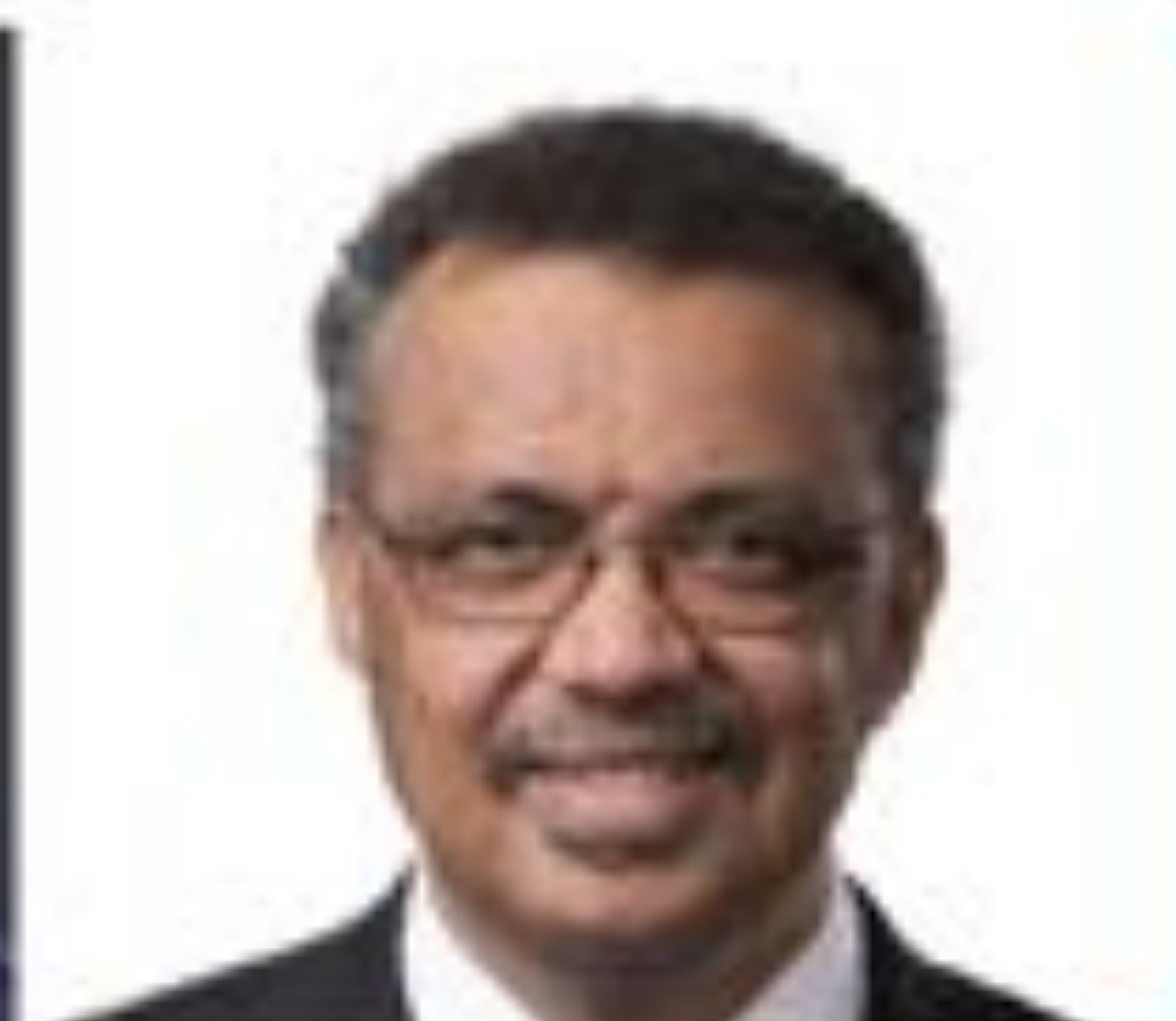
Dr. Tedros Adhanom Ghebreyesus Director-General of World Health Organization (WHO)