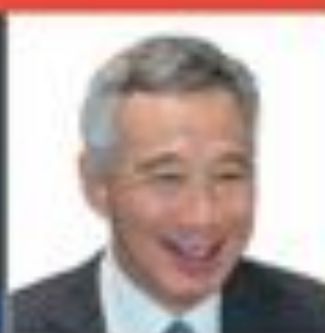
H.E. Lee Hsien Loong Prime Minister of Singapore