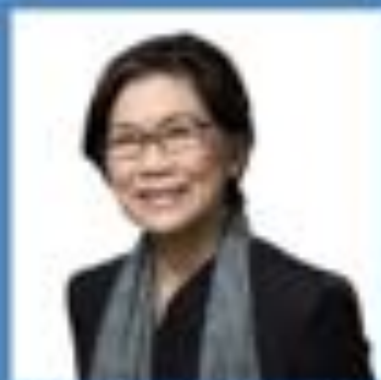
H.E. Chan Heng Chee Singaporean Ambassador-at-Large and Ambassador of Singapore to the United States (2016–2020)