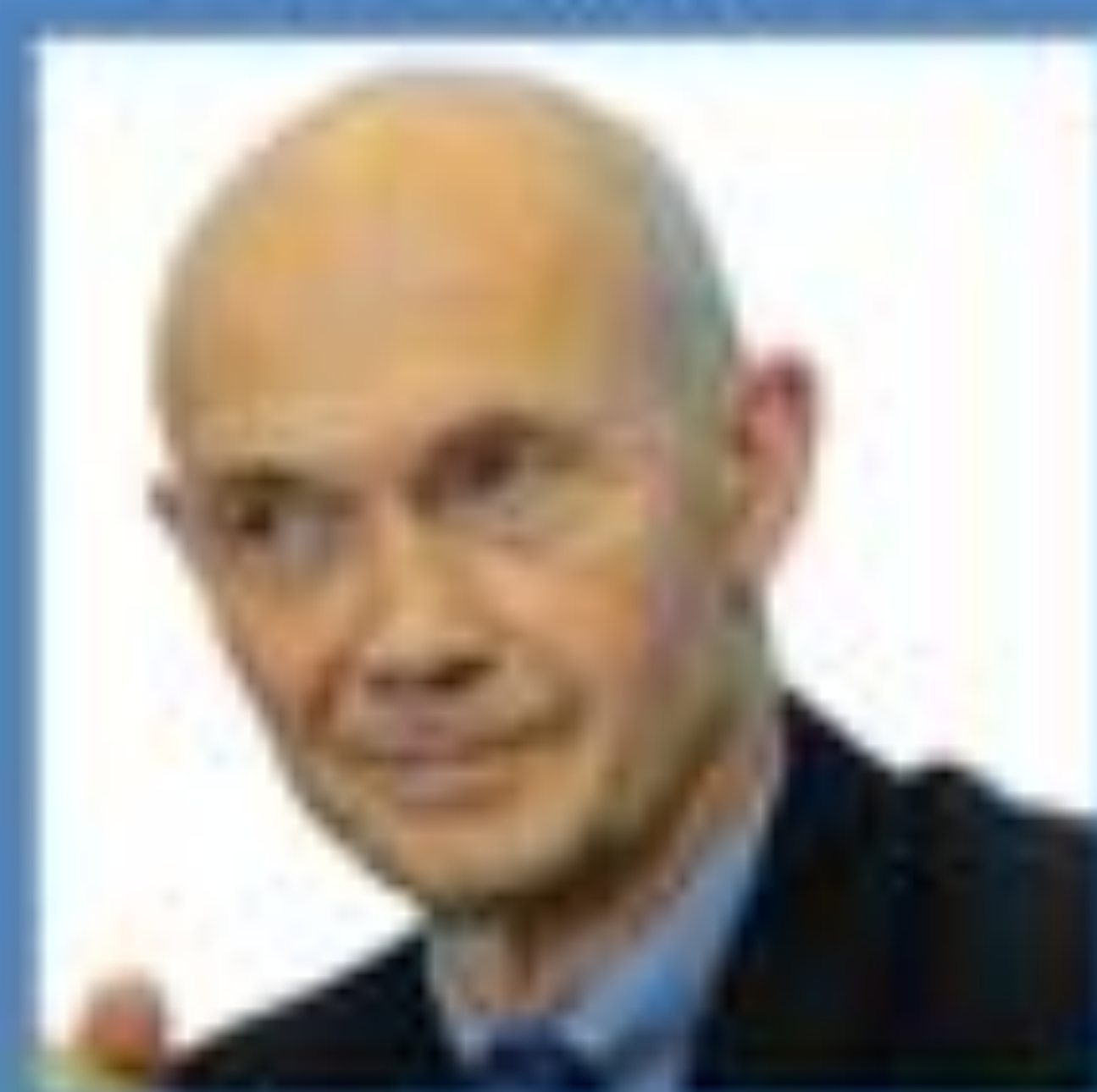
Pascal Lamy President of the Paris Peace Forum (PPF) and Director General of the World Trade Organization (WTO) (2005–2018)