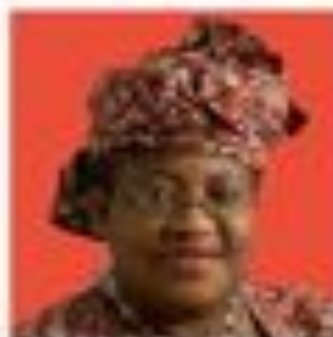
Dr. Ngozi Okonjo Iweala Director-General of World Trade Organization