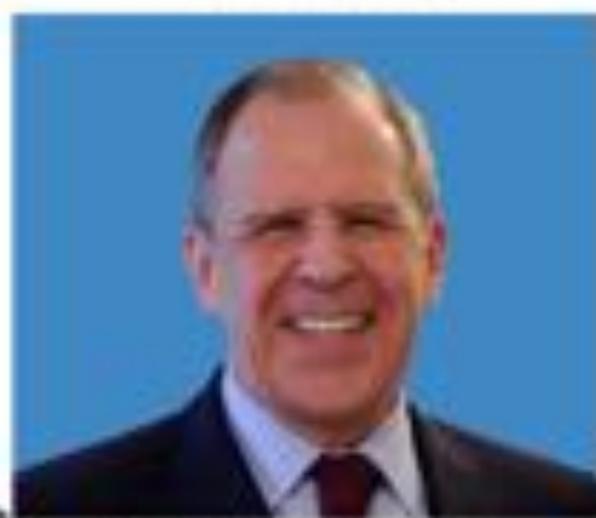
H.E. Sergey V. Lavrov Minister of Foreign Affairs of Russia