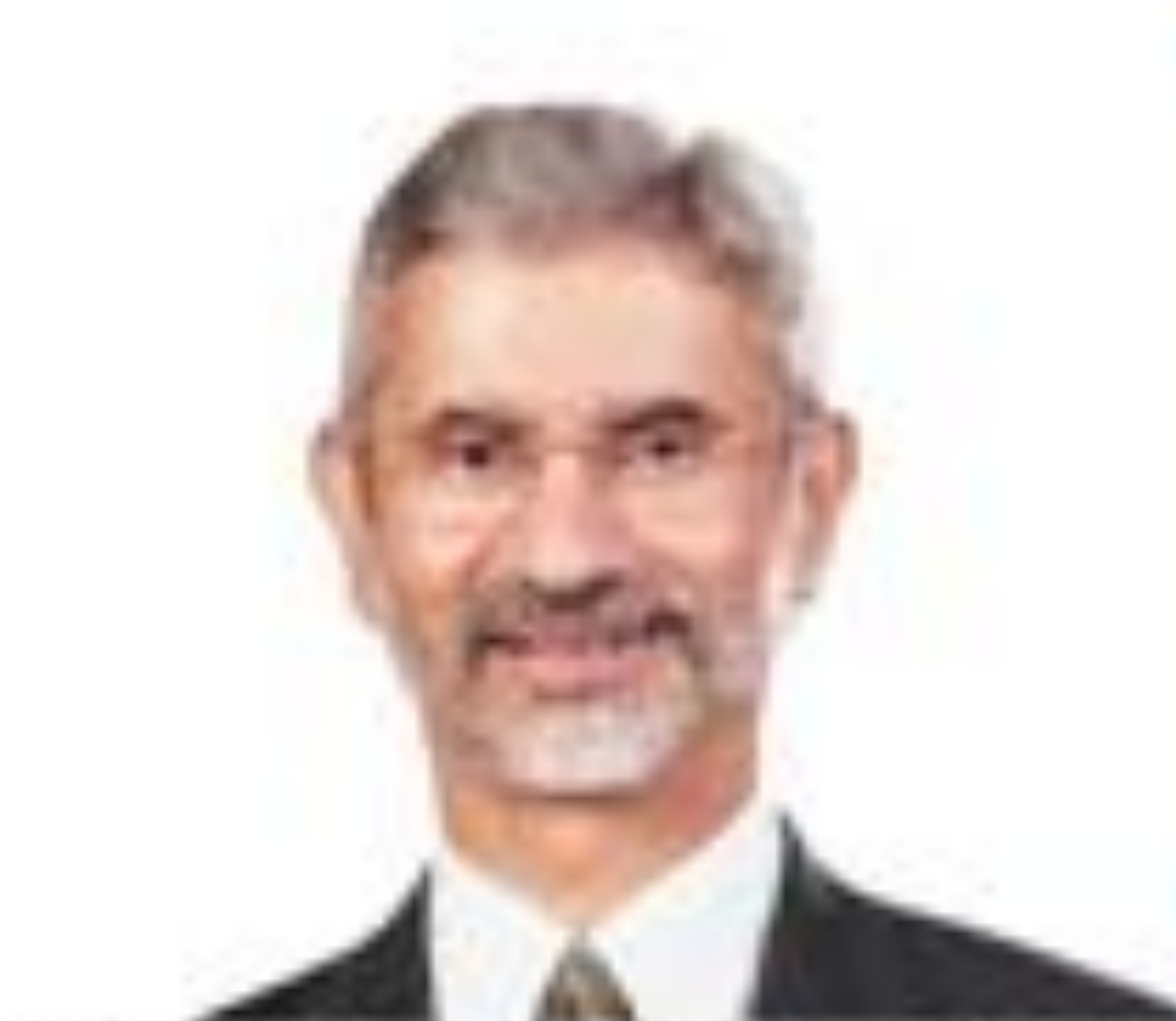
H.E. Dr. Subrahmanyam Jaishankar Minister of External Affairs of India