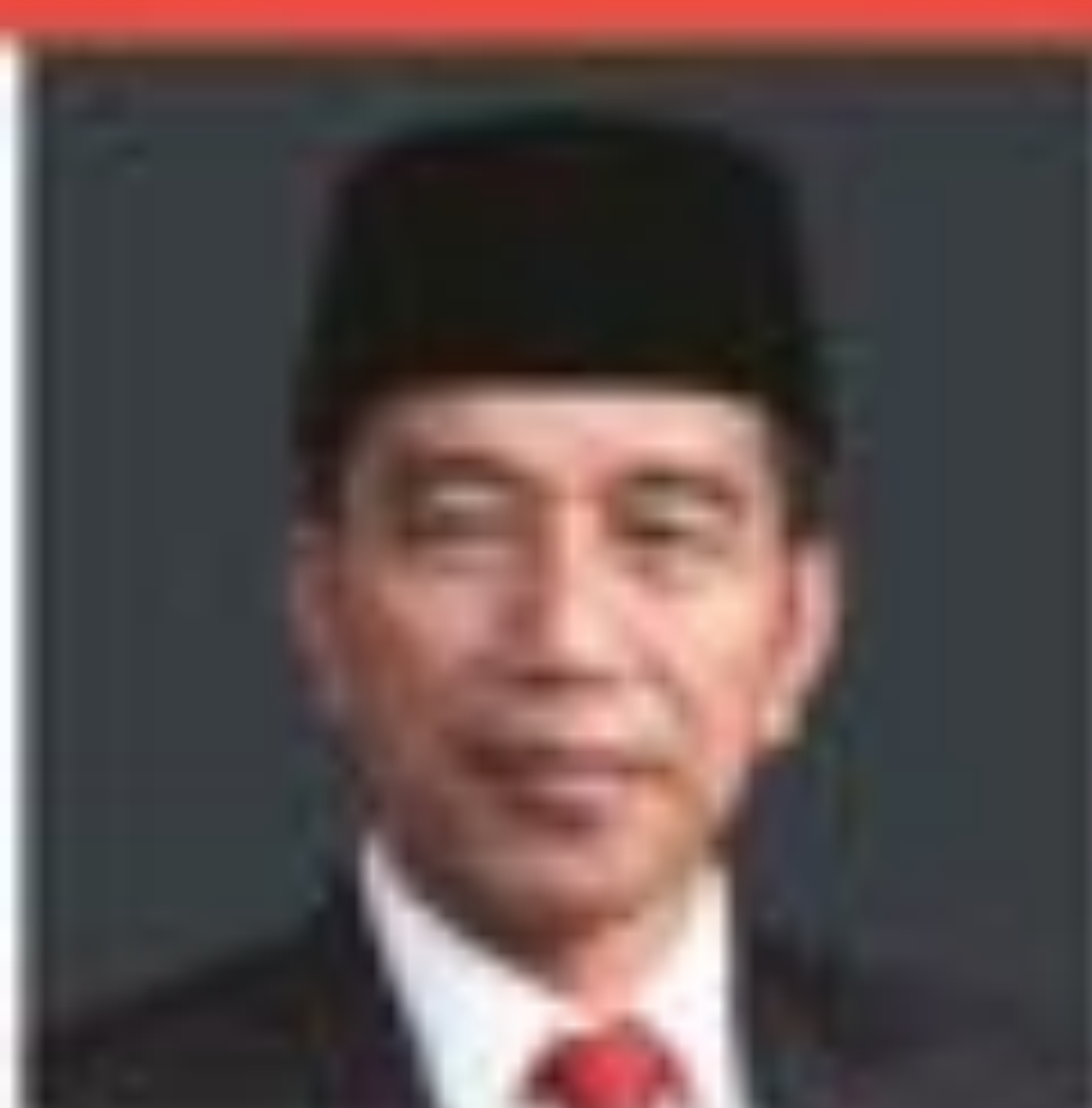
H.E. Ir. Joko Widodo President of Indonesia

We are inviting the following to share their views at the beginning of each session: President of Indonesia Joko Widodo, Prime Minister of New Zealand Jacinda Ardern, Prime Minister of Pakistan Imran Khan, Prime Minister of Canada Justin Trudeau, Prime Minister of Singapore Lee Hsien Loong, Prime Minister of Australia Scott John Morrison, State Councilor and Minister of Foreign Affairs of China Wang Yi, Secretary of State of the United States of America Antony Blinken, President of European Commission Ursula von der Leyen, Director-General of World Trade Organization Dr. Ngozi Okonjo Iweala, and Foreign Secretary of the United Kingdom Rt. Hon. Elizabeth Truss.