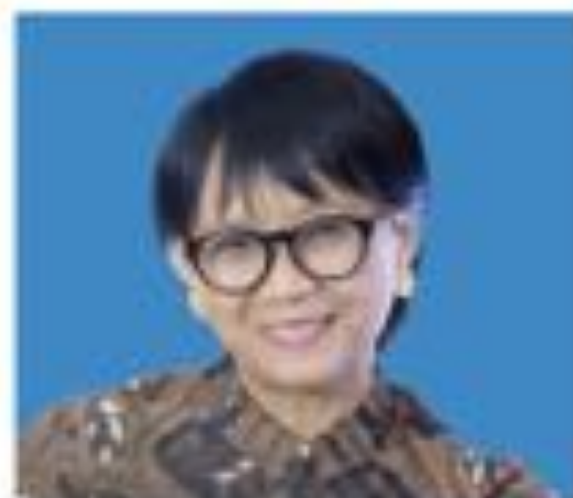
H.E. Retno Marsudi Minister of Foreign Affairs of Indonesia

The Global Town Hall strictly engages as speakers only high-quality leading minds who are experts, movers, and shakers in their fields. Last year, we had among our keynote speakers the Foreign Ministers of Indonesia Retno Marsudi, of China Wang Yi, of Australia Marise Payne, of India Subrahmanyam Jaishankar, of Russia Sergey Lavrov, of South Africa Naledi Pandor, and of the European Union Josep Borrell. We also had as speakers the Director-General of WHO, Tedros Ghebreyesus; the President of AIIB Jin Liqun and many others.