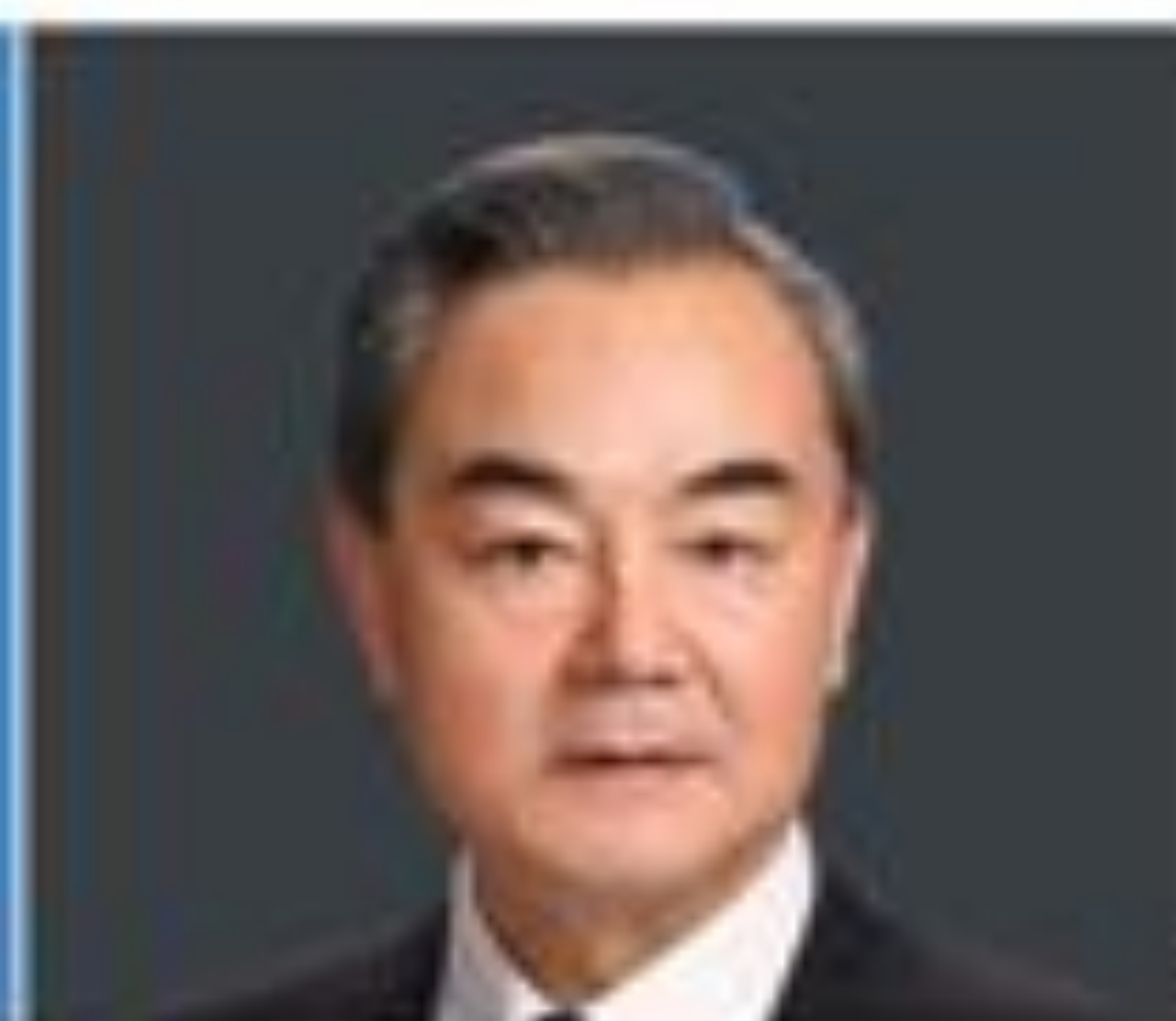
H.E. Wang Yi State Counselor and Minister of Foreign Affairs of China