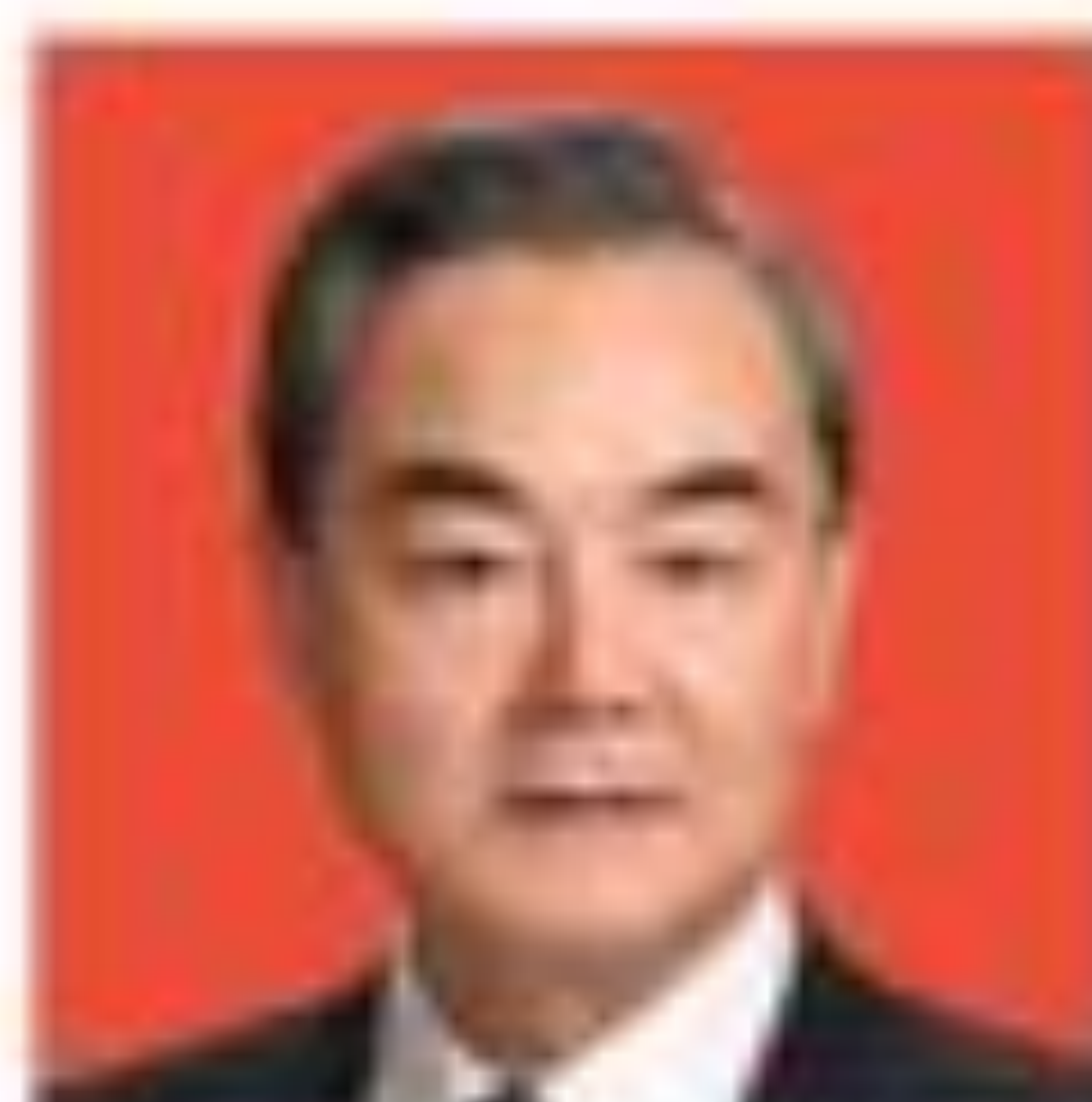
H.E. Wang Yi State Councilor and Minister of Foreign Affairs of China