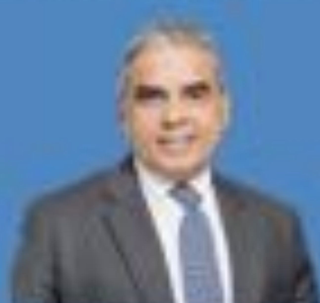
Prof. Kishore Mahbubani Distinguished Fellow of Asia Research Institute (ARI), National University of Singapore (NUS)