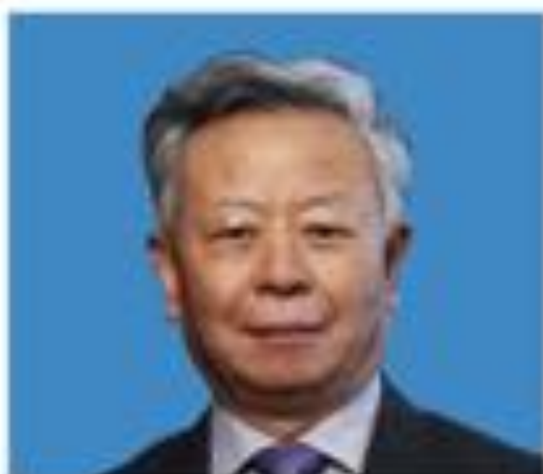
Jin Liqun President of the Asian Infrastructure Investment Bank (AIIB)